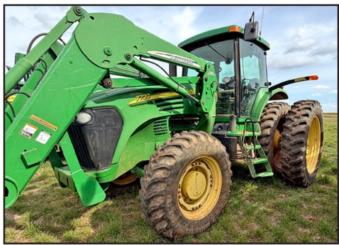
MADISON, ALABAMA OWNER: MURPHY FARMS

THURSDAY, MARCH 12, 2026 SALE TIME: 10:07 A.M.